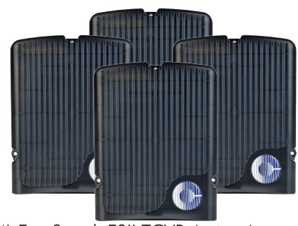
(4) FreeSpeak FSII-TCVR Active Antennas