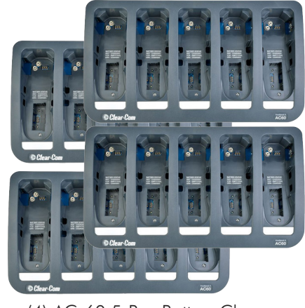
(4) AC-60 5-Bay Battery Chargers