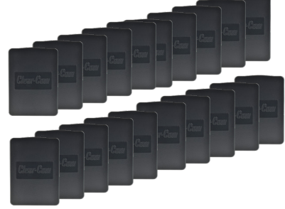
(20) FreeSpeak II Lithium-Ion Batteries